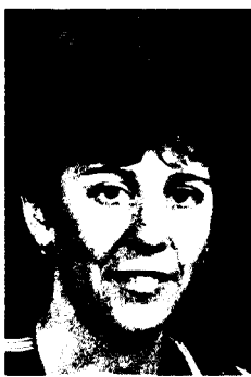
assistant at Texas A&I.