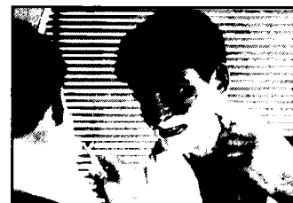
The Gillette Atra Plus® System. With the Lubra-smooth™ strip. The smooth feel of perfection. In your hand, and on your face. For the best a man can look and feel. For the best a man can be.