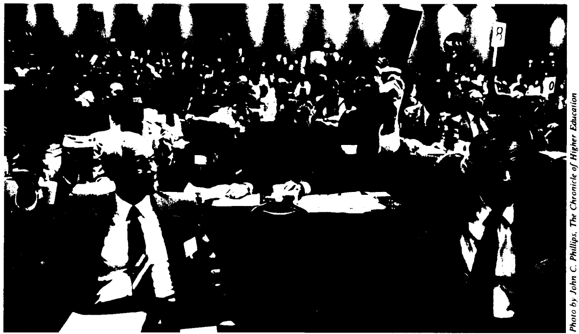
Delegates register their votes by paddle in non-roll-call vote at NCAA special Convention